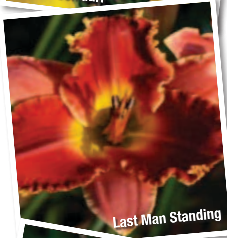
Last Man Standing